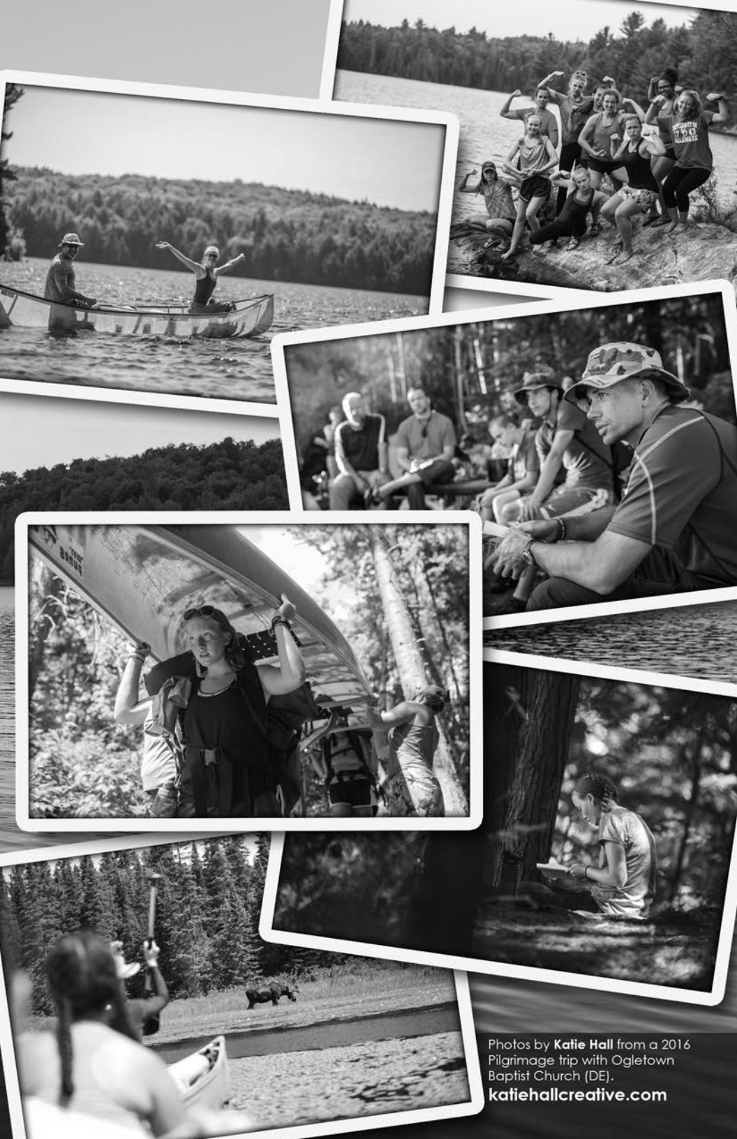
from a 2016 Pilgrimage trip with Ogletown Baptist Church (DE).